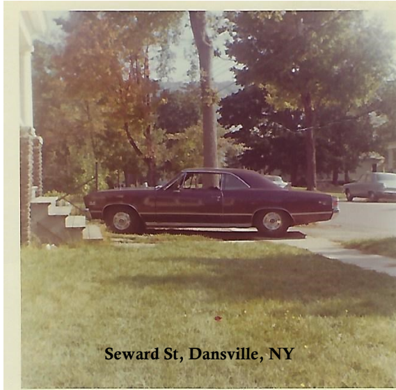
Seward St, Dansville, NY